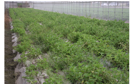
P-10 plant plantation in Taiwan

1 This statement has not been evaluated by the Food and Drug Administration. This product is not intended to diagnose, treat, cure, or prevent any disease.