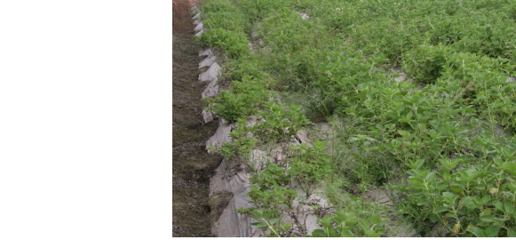
P-10 plant plantation in Taiwan

*CAUTION: Do not use or use cautiously if allergic to malt or malt products.